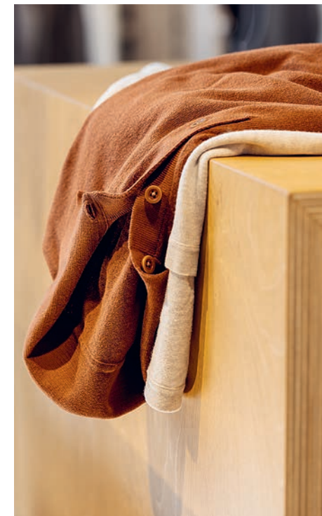
KS10251 & K10240

Perfect for spring, summer and autumn, cotton is an effortless choice for everyday comfort. It's an exceptional option for crew necks, polos or zip-closure styles — with single yarn ideal for warm summer days, and double yarn providing the perfect weight for in-between seasons.