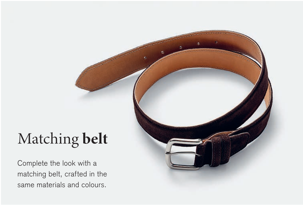
SDE20 Suede chocolate brown

Complete the look with a matching belt, crafted in the same materials and colours.