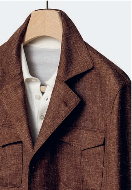
9185 (Wool, Silk & Linen)

Wool, Silk & Linen brings together the best of natural fibres in a fabric that feels lightweight and breathable. Defined by its subtle texture and crisp handfeel, it offers a refined balance of comfort and character, perfect for the season ahead.