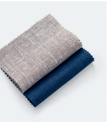
9183 & 9201 (Linen Wool Silk Stretch)

Linen Wool Silk Stretch is a versatile fabric with a relaxed character that showcases the natural texture and visual richness of linen. Crafted by Ermenegildo Zegna, it undergoes an overdyed process that enhances its tridimensional effect, creating depth and subtle variation in colour. Lightweight and soft with a natural elastic drape, it is the go-to choice for effortlessly elegant garments with a casual ease.