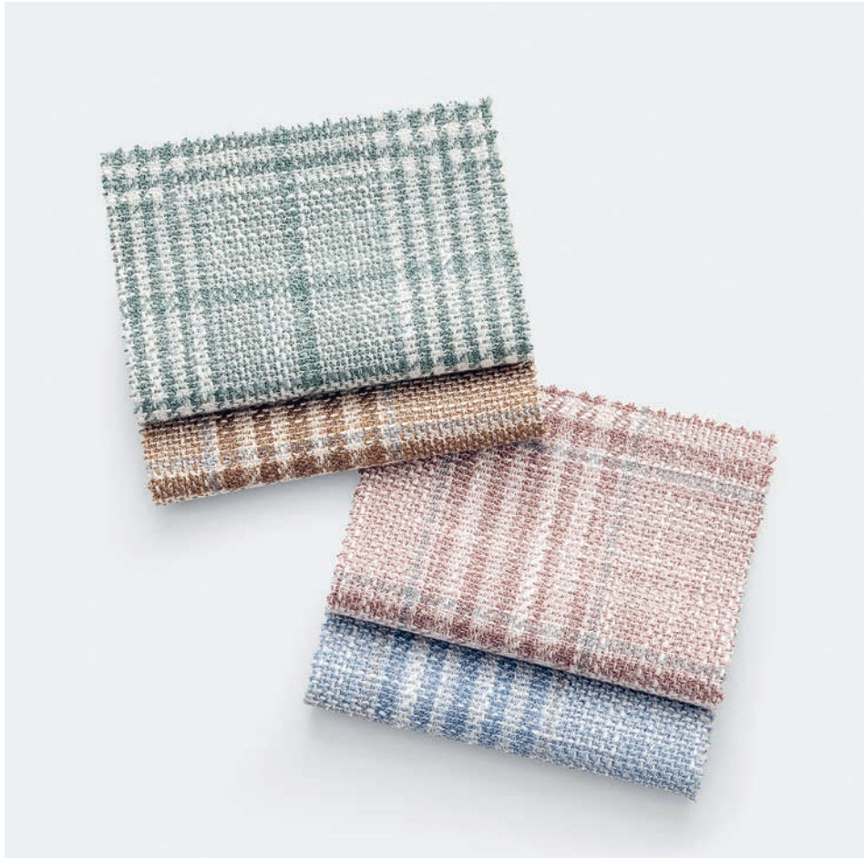
9194, 9188, 9191 & 9196 (Softime)

Silk Houndstooth , crafted from pure silk, combines luxury with a sporty countryside character. These fabrics are the perfect companion for elevated casual wear that does not compromise on refinement, offering a distinctive look with a smooth and sophisticated feel.