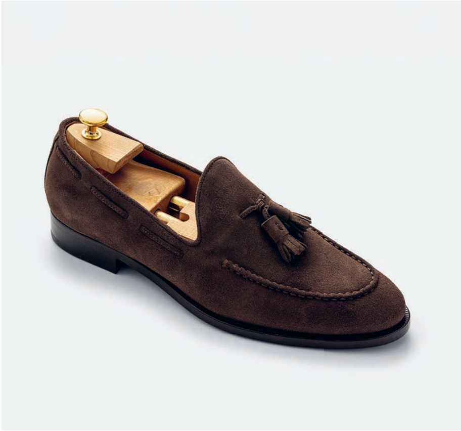
SDE20 Suede chocolate brown

Chrome-tanned calfskin leather from Portugal. Featuring a unique water-resistant