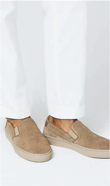
Look 9193 Teal mélange wool-silk-linen twill utility jacket - K10168 LP S160 off-white ultra-fine merino crew neck - COG013 Off-white garment-dyed stretch cotton twill 5-pocket pants - SDE12 Natural suede slip-on sneaker ( Made in Portugal )