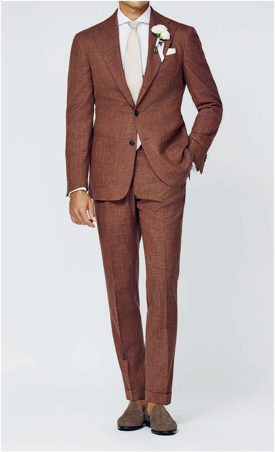
Look 6070 (LP - SU) Terracotta mélange tropical wool-silk-linen suit - SH00144 White cotton dobby shirt - TWD013 Platinum herringbone linen-silk tie - PSILK029 Off white silk pocket square - SDE15 Taupe suede plain toe loafers ( Made in Portugal )