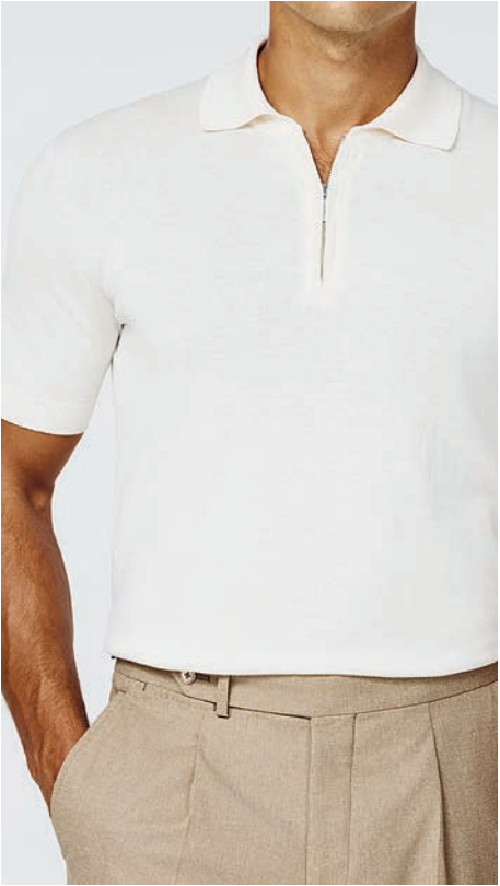
Look 6065 Beige stretch wool blend twill utility jacket - K10152 Off-white cotton-silk half-zip polo 6065 Beige stretch wool blend twill trousers - SUS03 Chocolate brown summer suede tassel loafers ( Made in Italy )