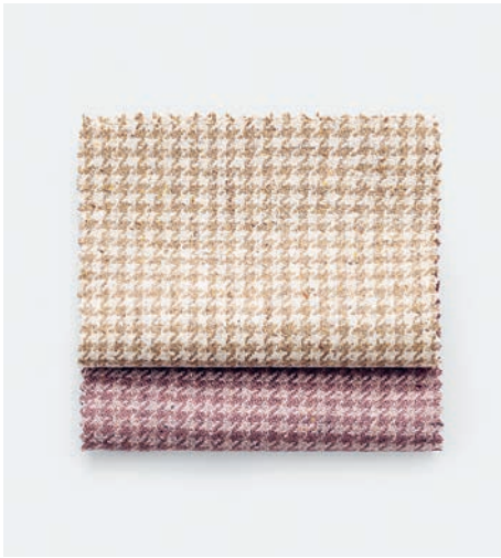
9187 & 9190 (Silk Houndstooth)

Softime blends wool, cotton, silk and linen into a fabric of remarkable softness and sophistication. The combination of cotton and silk lends an exceptional lustre and