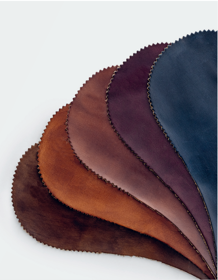
NUB04, NUB02, NUB03, NUB01 & NUB05

The meticulous process of layering, drying and finishing makes every shoe a one-of-a-kind expression of craftsmanship. Offered in five colours: dark brown, chocolate brown, nut brown,