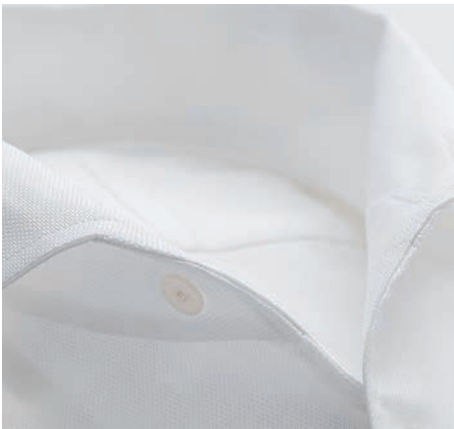
SH00436 (Yoga stretch cottons by Albini)