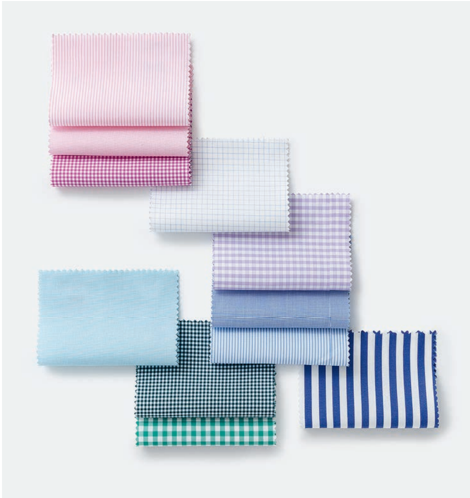
SH00451, SH00460, SH00465, SH00491, SH00475, SH00457, SH00446, SH00458, SH00468, SH00480 & SH00454

Compact cotton A crisp two-tone gingham check in a light twill weave crafted from fine 70s yarns. Naturally breathable and durable, it has a smooth handfeel and an elegant drape suited to both work and casual wear. This 100% cotton quality is easy to care for and available in five tattersall checks.