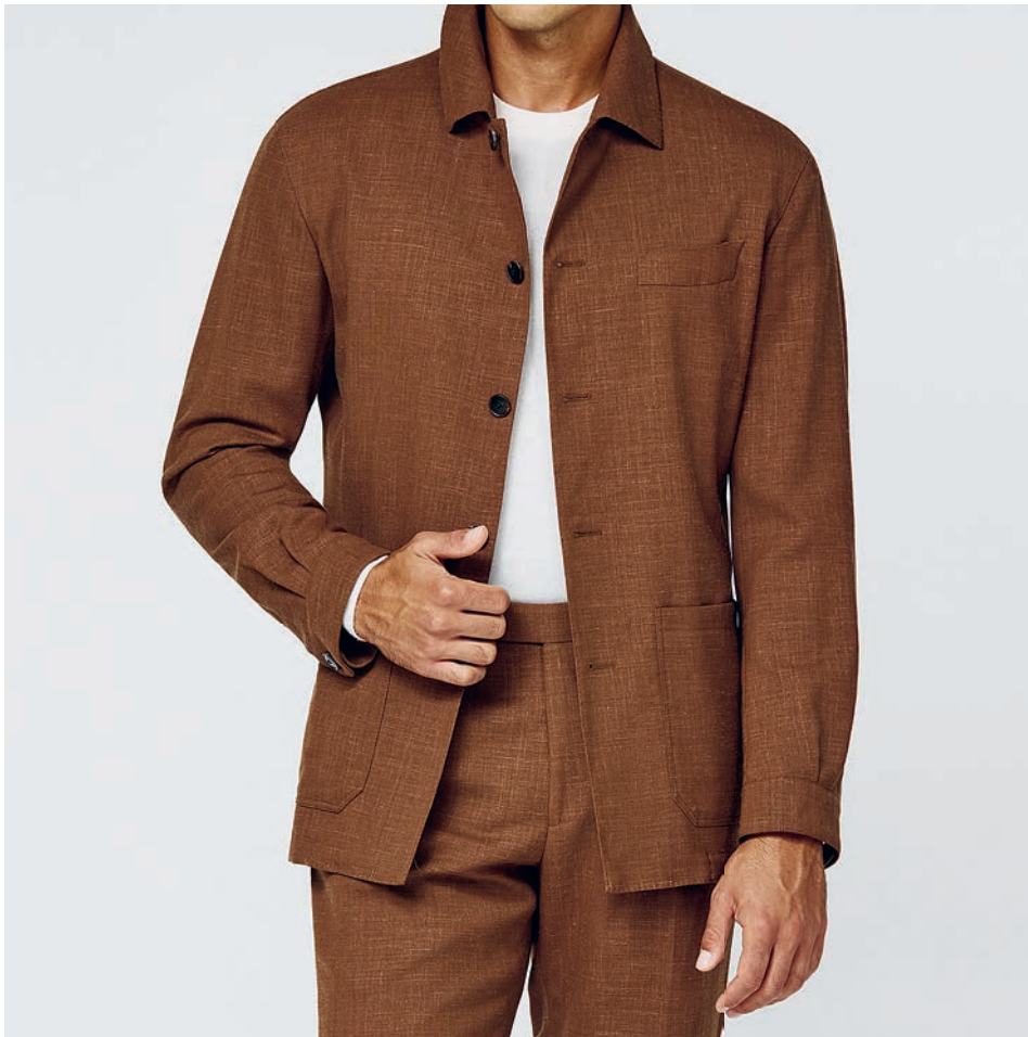
Look 6069 Ginger stretch tropical wool-linen blend utility jacket - K10084 Off-white cashmere-silk crew neck - 6069 Ginger stretch tropical wool-linen blend trousers - SUS03 Chocolate brown summer suede tassel loafers ( Made in Italy )

From the rich depth of a ginger wool-linen tropical blend to the subtle contrast of a light brown & sand wool-linen-silk glencheck, these suits capture the relaxed sophistication of the season. Crafted from lightweight, breathable blends, they offer refined comfort ideal for warmer days and destination settings.