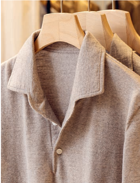
One-piece collar polo

Italian excellence throughout: suits crafted from Summertime and Jersely qualities, linen blends and pure silk (p. 47), while jackets gain new depth with herringbone from Ferla and Softime fabrics made in Italy by Loro Piana (p. 45). Shirts evolve to meet the moment with Yoga natural-stretch cottons by Albini, cotton-linen chambray, seersucker and washed cotton denim (p. 85).