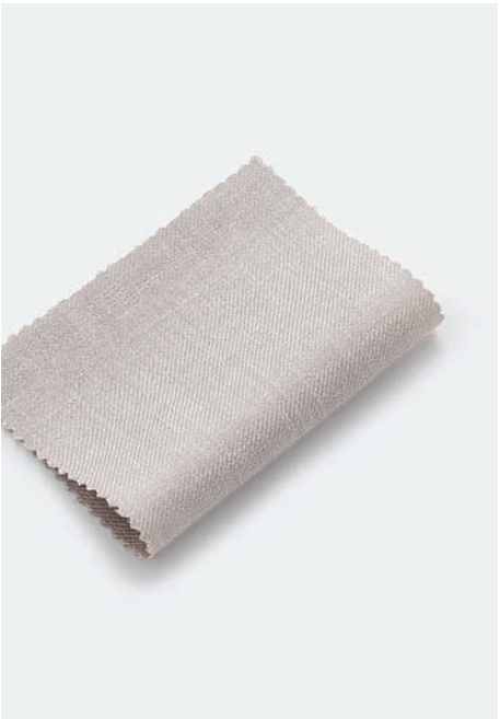
9181 (Wool, Silk & Linen)

Soft Neutrals brings together a selection of fabrics united by their refined palette of natural tones. Distinguished by patterns such as herringbone, houndstooth, glencheck and windowpane, this group balances elegance with ease. Perfect for a smart-casual wardrobe, the fabrics offer versatile options that feel contemporary while remaining timeless.