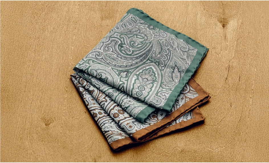
PS620 & PS613

Each piece is brought to life on 100% silk twill, where intricate motifs unfold in vibrant seasonal tones — from classic paisleys and chain-inspired designs to bold tulip prints and contemporary interpretations of heritage patterns.