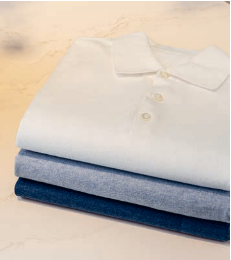
Ultra-fine Pima cotton yarn quality