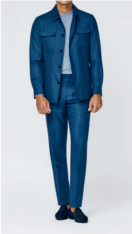
Look 6082 (LP - LW) Denim blue linen-wool-silk sharkskin utility jacket - K10158 LP S160 l.slate blue ultra-fine merino crew neck - SDE25 Navy suede plain toe loafers (Made in Portugal)

A denim-blue utility suit in a linen-wool-silk blend offers casual structure with a luxurious touch, while a Neapolitan blue mélange wool-silk-linen jacket adds richness and depth. Together, they reimagine utility through colour, texture and contemporary ease.