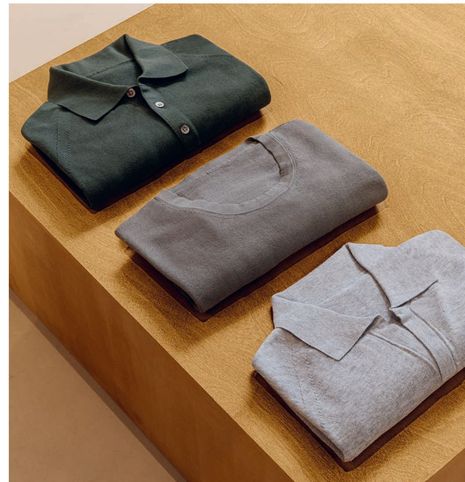
K10253, K10243 & K10237