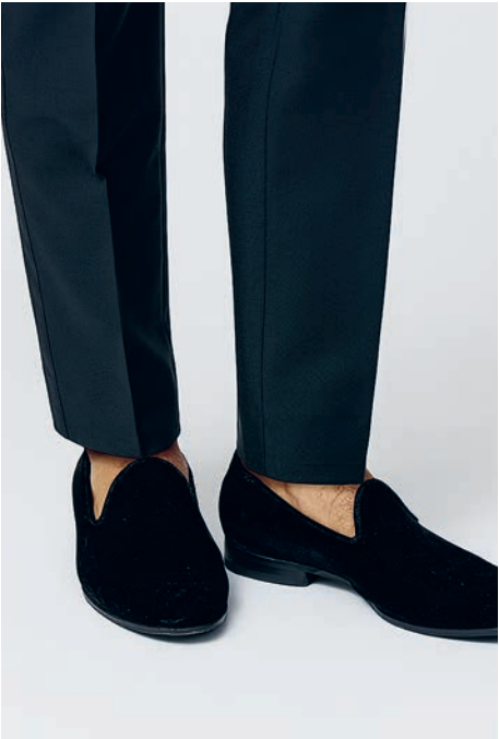
Look TUX006 Black tropical wool-mohair tuxedo - SH00144 White cotton dobby tuxedo shirt - TSAT003 Black satin bow tie - VELV001 black velvet plain toe loafers (Made in Italy)