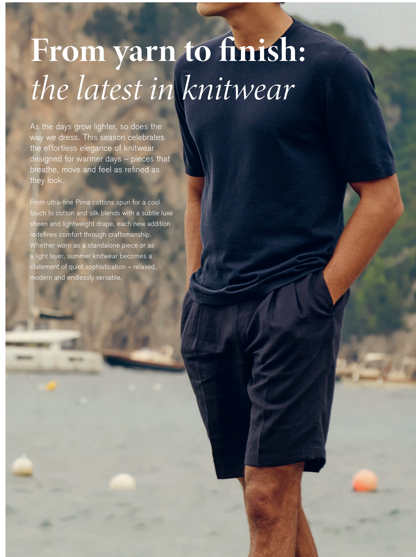
K10148 & LIN003

From ultra-fine Pima cottons spun for a cool touch to cotton and silk blends with a subtle luxe sheen and lightweight drape, each new addition redefines comfort through craftsmanship. Whether worn as a standalone piece or as a light layer, summer knitwear becomes a statement of quiet sophistication – relaxed, modern and endlessly versatile.