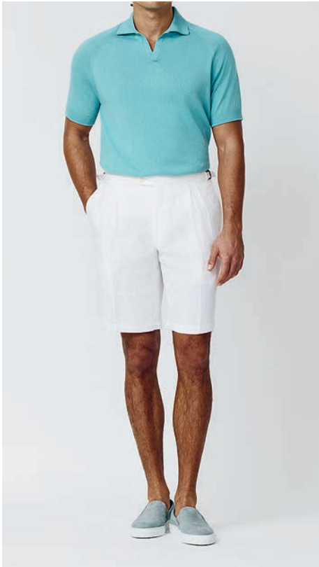
Look KS10245 Sea green cotton polo knit - LIN001 White linen plain weave Bermuda - SDE24 Jeans suede slip-on sneakers ( Made in Portugal )

A soft petrol knit in breathable Pima cotton brings an easy, relaxed foundation, while the teal jacket in a wool-silk-linen blend adds depth with its refined weave and natural sheen. Together, they create a harmonious balance of comfort and sophistication, expressed through colour and material.