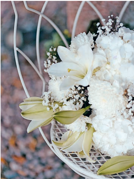
Get ready for wedding season

Spring/Summer 2026 marks a season of ease in motion – an evolution of menswear shaped by breathable fabrics, natural stretch and the quiet confidence of lighter, looser silhouettes. This collection traces a deliberate arc: breaking away from tradition just long enough to rediscover why it mattered in the first place. Refined patterns, airy textures and a fresh spectrum of colours bring renewed clarity to warm-weather dressing, while craftsmanship remains firmly rooted in the world's most esteemed mills.