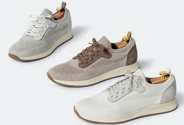
KNI07, KNI02 & KNI01

The knit material offers a sock-like fit that adapts to the shape of the foot. For this style, leather is chosen as the secondary material to add structure, durability and a refined finish.