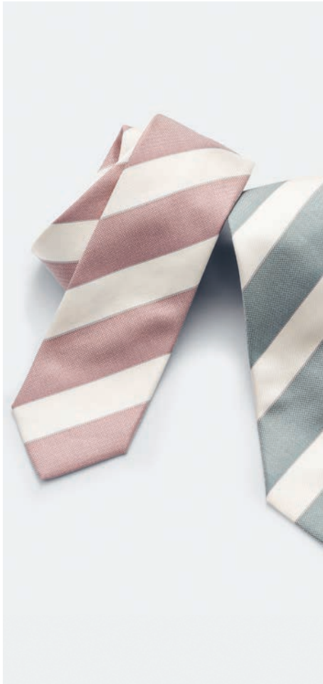
TS843 & TS845 (Basketweave)

In contrast, the basketweave series stands out through its distinctive structure — a subtle yet striking texture that balances polish with contemporary appeal. Bold striped versions in cobalt, copper, green or red make a confident statement, while multi-coloured variations in teal or slate blue introduce a playful note to celebratory dressing. For a more understated approach, the mocha and copper silk options exude quiet elegance, ideal for eveningwear or refined business attire.