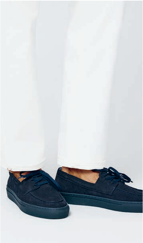
Look 9197 Neapolitan blue mélange wool-silk-linen twill utility jacket - K10124 White cotton-cashmere polo - DEN006 White selvedge stretch 5-pocket pants - SDE26 Midnight blue suede sneakers (Made in Portugal)