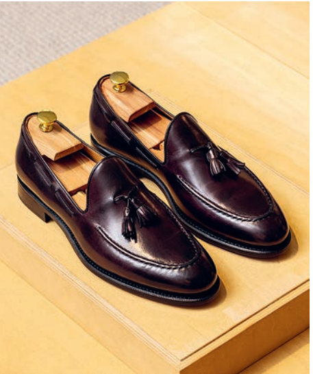
Hand-painted nubuck tassel loafers