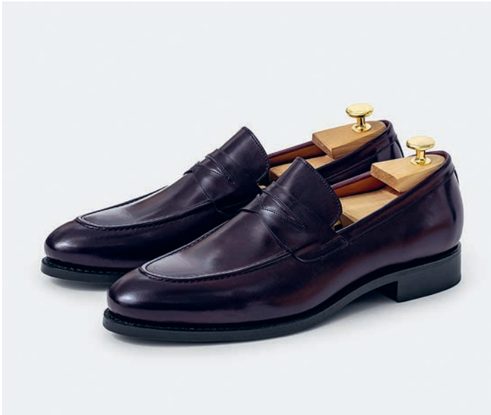
NUB01 Nubuck hand-painted bordeaux

An artisanal highlight: our new nubuck hand-painted leather. Each pair is hand-dyed directly on the last, resulting in a rich, authentic finish with natural depth and texture. No two pairs are ever the same.