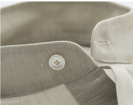
SH00443 (Cotton-Linen Chambray)

Cotton-linen chambray A refined blend of cotton and linen highlights the natural beauty and texture of this fabric. Light, breathable and comfortably structured, it offers natural flexibility without added stretch. With its crisp yet soft handfeel and fluid drape, it’s perfect for both relaxed and refined looks. Easy to care for, more sustainable and biodegradable, it’s a timeless four-season essential for modern shirting. This season, the collection expands with two new 365 fabrics and one 365 Seasonal.