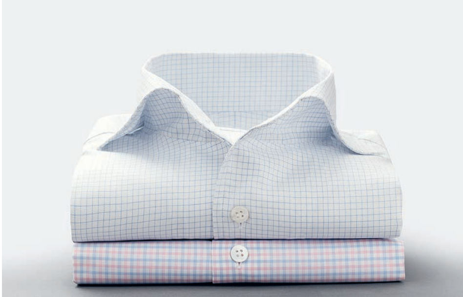
SH00491 & SH00485 (Fine compact cotton)

Fine compact cotton Crafted with a Royal twill density, this 2-ply cotton twill offers a luxurious touch with a smooth, comfortable feel. The range includes one check, three gingham checks and three tattersall checks, each bringing its own character and polished handfeel.