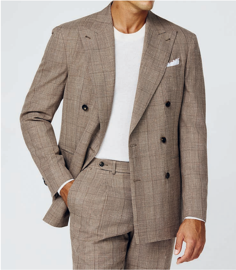
Look 6067 (LP - SU) L.brown-sand wool-silk-linen glencheck double breasted jacket - K10084 Off-white cashmere-silk crew neck - PLIN007 White linen mid brown handstitched pocket square - 6067 (LP - SU) L.brown-sand wool-silk-linen glencheck trousers - SDE15 Taupe suede penny loafers ( Made in Portugal )