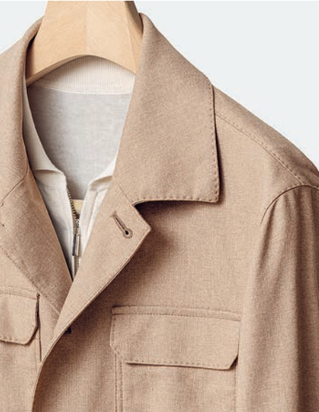
6065 (Wool Stretch)

Wool Stretch is a versatile blend of wool, polyamide and Lycra® that delivers comfort with a refined finish. Crease resistant and easy to care for, it remains breathable and suitable for year-round wear. Ideal for both formal and more casual occasions, this fabric combines practicality with elegance and is available in one sophisticated beige shade.