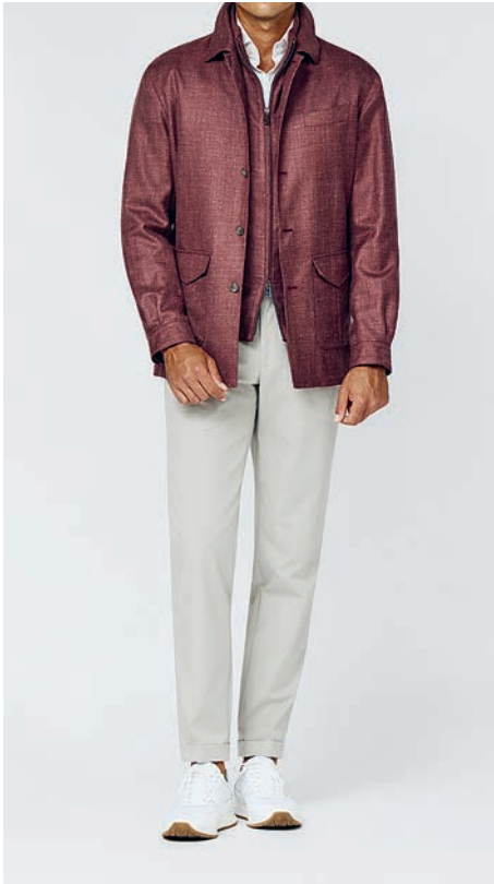
Look 9189 Dusty red mélange wool-silk-linen twill utility jacket - 9189 Dusty red mélange wool-silk-linen twill vest with zip - SH00176 White cotton piqué knit shirt - OLM003 Bone stretch water-repellent technical drawstring trousers - SNG07 White sneaker grain calf sneakers ( Made in Portugal )

A celebration of rich tones and refined textures. From soft rust pink to deep rusty red, these looks explore the expressive side of menswear colour. Defined by utility-inspired silhouettes and sophisticated layering, they bring depth and warmth to the modern wardrobe.