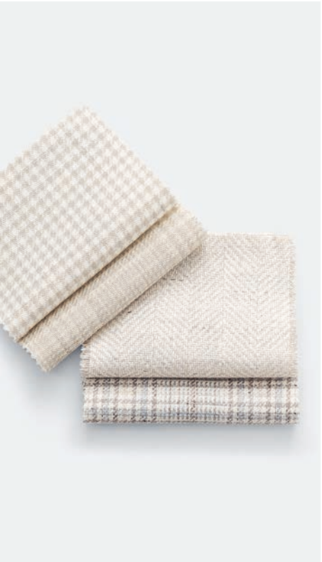
9178, 9179, 9177 & 9180 (Soft Neutrals)

Soft Neutrals brings together a selection of fabrics united by their refined palette of natural tones. Distinguished by patterns such as herringbone, houndstooth, glencheck and windowpane, this group balances elegance with ease. Perfect for a smart-casual wardrobe, the fabrics offer versatile options that feel contemporary while remaining timeless.