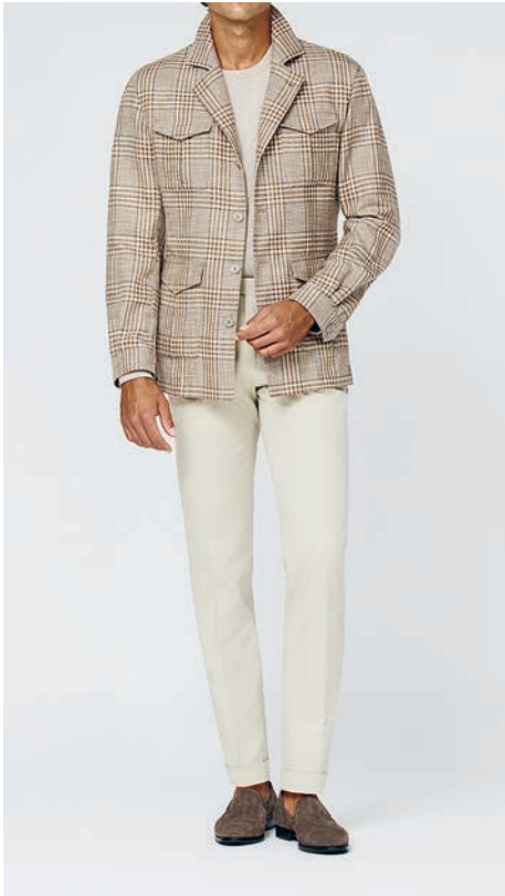
Look 9188 (LP - STE) Tan-ivory wool-cotton-silk-linen glencheck and storm grey windowpane utility jacket - K10126 Sand cotton-cashmere crew neck - Cotton 008 Sand stretch cotton trousers - SDE18 Tobacco suede plain toe loafers ( Made in Portugal )

A beige stretch wool-blend twill offers a clean, contemporary base, while a tan-ivory glencheck with a subtle storm-grey windowpane introduces texture and dimension. Together, they strike a balance between structure and softness, creating a look that feels both sophisticated and versatile.