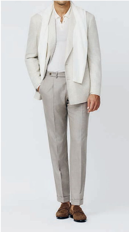
Look 9178 Ivory-ecru wool-silk-linen houndstooth jacket - K10168 LP S160 off-white ultra-fine merino polo knit - DR062 L.taupe mélange S130 wool twill trousers - SDE15 Taupe suede penny loafers (Made in Portugal)

These looks embody quiet sophistication. Soft in hue yet rich in detail, they bring a serene and contemporary elegance to modern tailoring.