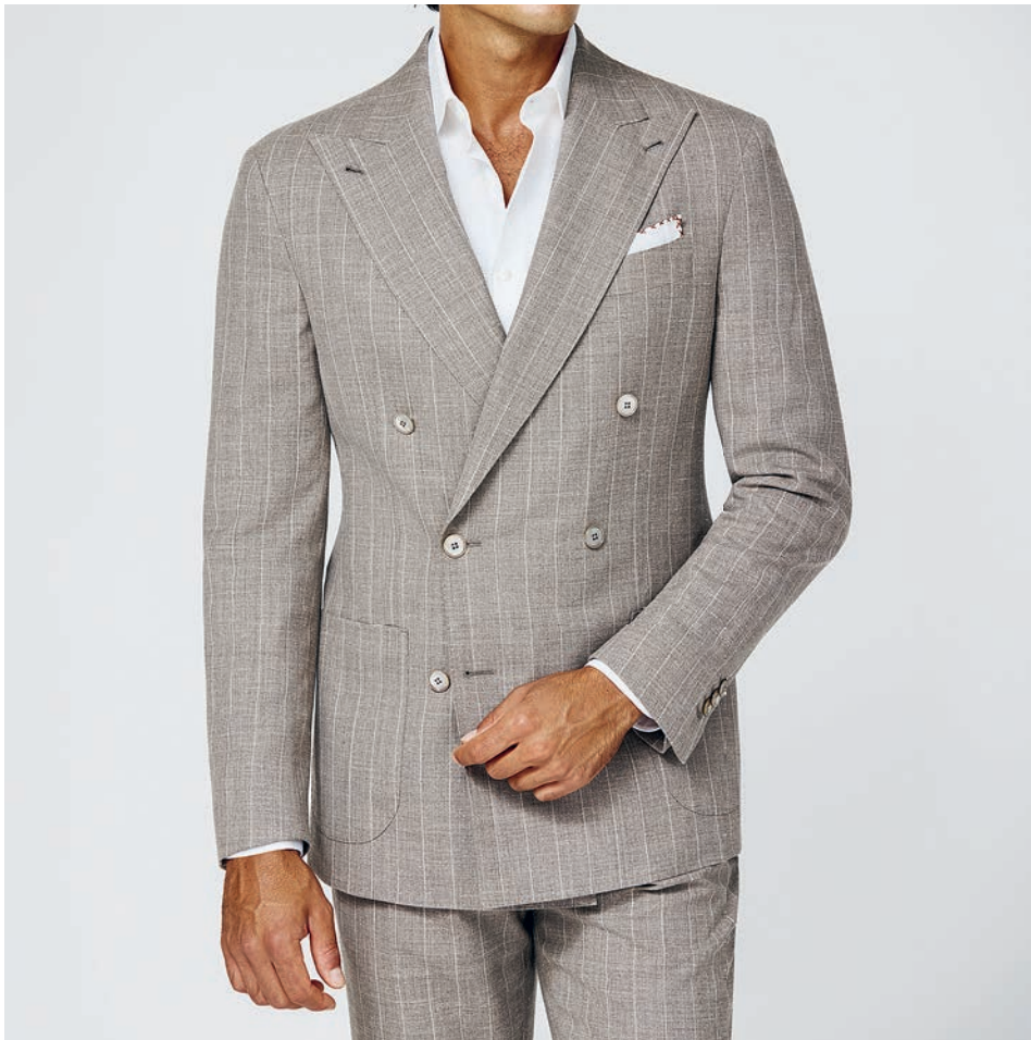
Look 6059 (LP - PN) L.taupe wool-silk-linen plain weave with pencil stripe suit - SH00162 White cotton-linen shirt - PLIN007 White linen m. brown handsitched pocket square - SDE15 Taupe suede penny loafers (Made in Portugal)

The bone mélange linen-wool-silk sharkskin suit offers a softer, textured look with a relaxed yet polished presence. Together, they define a season characterised by gentle neutrals, airy fabrics and quietly confident tailoring – demonstrating how colour contrast can remain subtle yet striking within a refined tailoring palette.