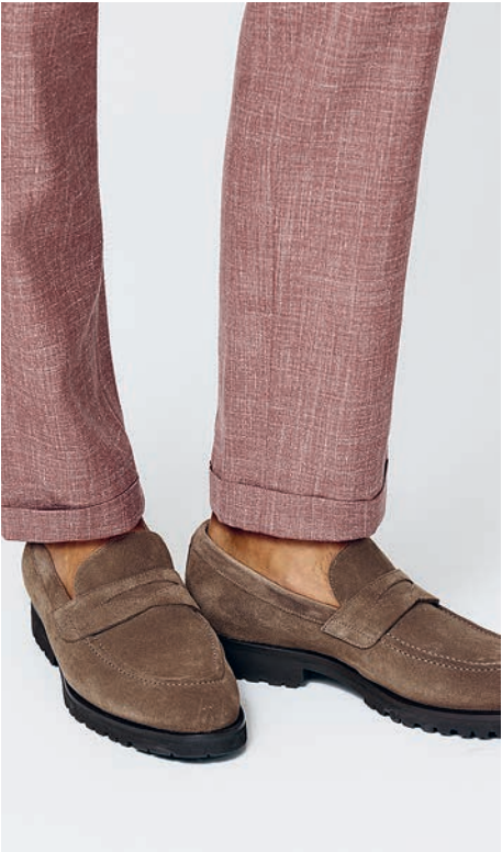
Look 6073 (LP - SU) Rust pink mélange tropical wool-silk-linen utility jacket - K10151 White cotton-silk crew neck - 6073 (LP - SU) Rust pink mélange tropical wool-silk-linen drawstring trousers - SDE06 Taupe suede penny loafers ( Made in Italy )