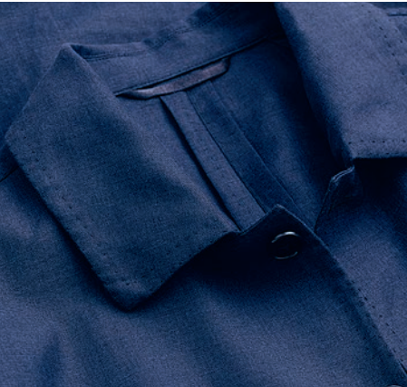
6085 (Linen Way)

Linen Way is an extraordinary combination of linen, wool and silk that unites the natural texture of linen with the softness of wool and the subtle shine of silk. It offers double comfort through a woven bi-stretch version produced without any technical fibres.