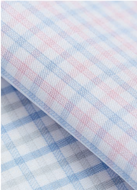
SH00496 & SH00491 (Fine compact 2-ply cotton twill)

Fine compact cotton Crafted with a Royal twill density, this 2-ply cotton twill offers a luxurious touch with a smooth, comfortable feel. The range includes one check, three gingham checks and three tattersall checks, each bringing its own character and polished handfeel.