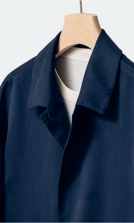
6056 (Soft Silk Twill)

365 doppio suit fabrics are specially developed for Munro. This S130 wool uses double twisted yarns to enhance the natural qualities of the fibre. The result is a fabric with a refined drape, a luxurious hand and impressive durability. With a subtle natural stretch and strong crease resistance, it offers reliable comfort and performance throughout all four seasons.