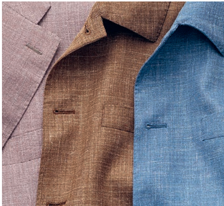
9207, 9206 & 9208 (Jersely Basketweave)

Jersely Basketweave introduces a unique expression within the Jersely line made in Italy by Loro Piana. Woven from a blend of wool, cotton, silk and linen, it brings together softness, resilience and breathability with the added character of a basketweave structure. The result is a fabric that feels relaxed yet sophisticated, offering subtle texture for an effortlessly elevated wardrobe.