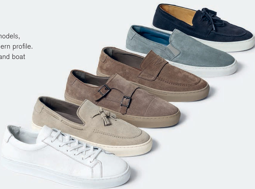
SNG07, SDE27, SDE14, SDE18, SDE24 & SDE25

Choose from six sneaker models, each offering a clean, modern profile. From low-tops to slip-ons and boat shoe sneakers.