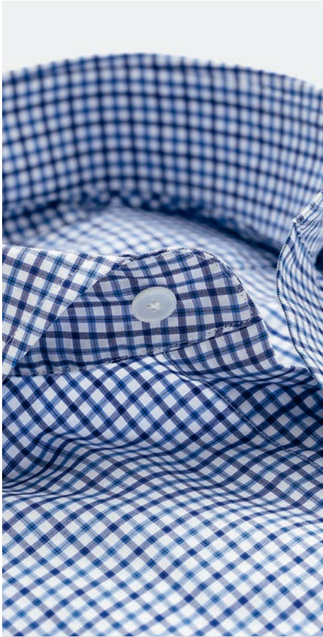
SH00490 (Compact cotton)

Crafted from airy cottons in refined twills and crisp poplins, the range stands out with a rich mix of designs, from bold checks and classic glencheck to lively stripes and bright solid shades. Many of these qualities are sourced from Thomas Mason, celebrated for its sharp designs and exceptional handfeel. Each fabric is lightweight, breathable and vibrant, offering a fresh expression for every mood and occasion.