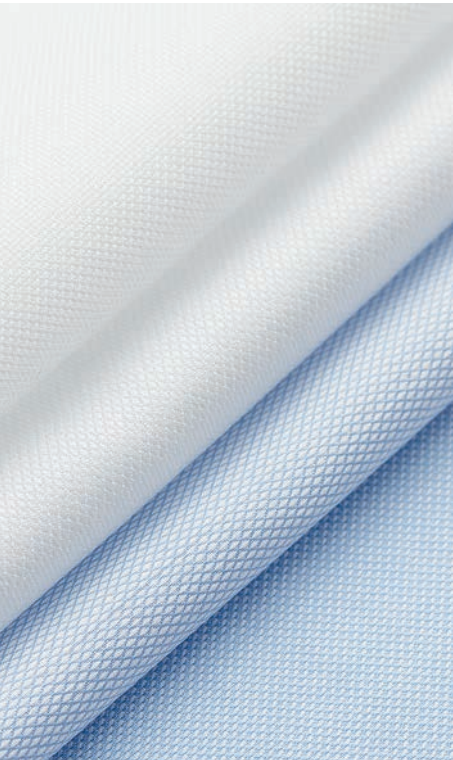
SH00435, SH00437, SH00436 & SH00434 (Yoga stretch cottons by Albini)

From innovative Yoga natural stretch cottons by Albini to airy chambrays, seersuckers and refined seasonal colours, each fabric is designed to move with you and feel effortless in every setting.