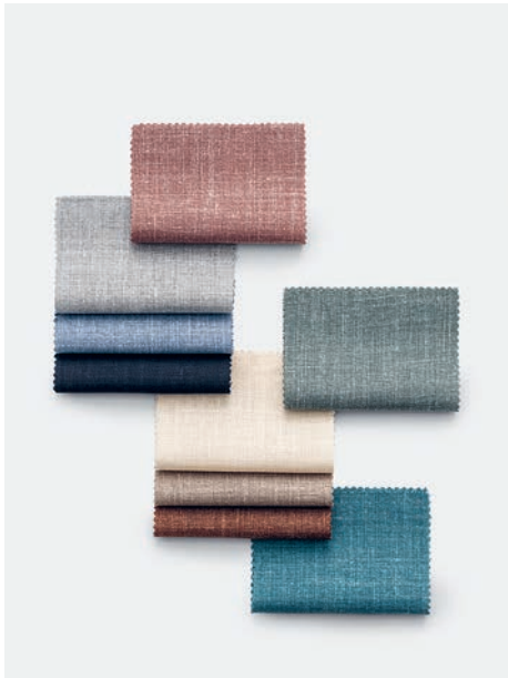
Refined linen blend fabric qualities