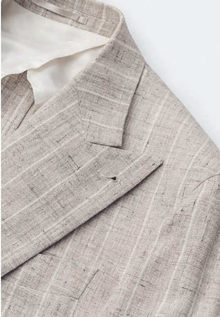
6057 (Linen-Cotton blend)

365 doppio suit fabrics are specially developed for Munro. This S130 wool uses double twisted yarns to enhance the natural qualities of the fibre. The result is a fabric with a refined drape, a luxurious hand and impressive durability. With a subtle natural stretch and strong crease resistance, it offers reliable comfort and performance throughout all four seasons.