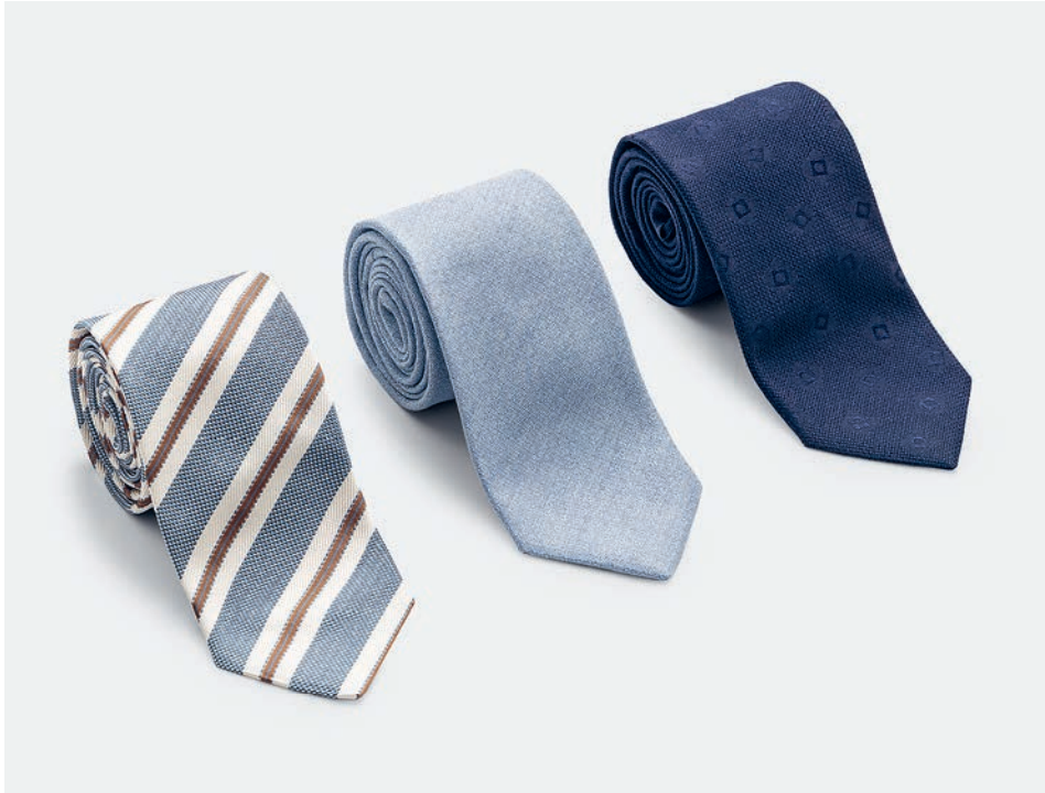
TS847, TS838 & TS837