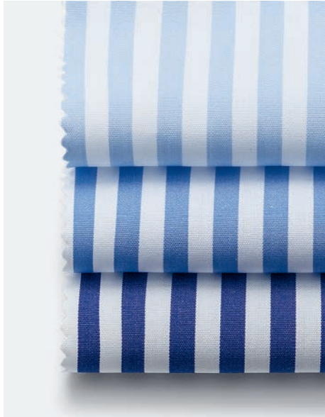
SH00454, SH00453 & SH00452 (Fine cotton)

Fine cotton bold stripes This cotton poplin blends heritage with modern refinement. Its 2-ply construction delivers crisp definition in stripes and rich depth in solids. Crafted from fine twisted yarns, it achieves a compact yet breathable feel with lasting softness and durability. Available in four bold stripe designs for sharp, versatile styling.