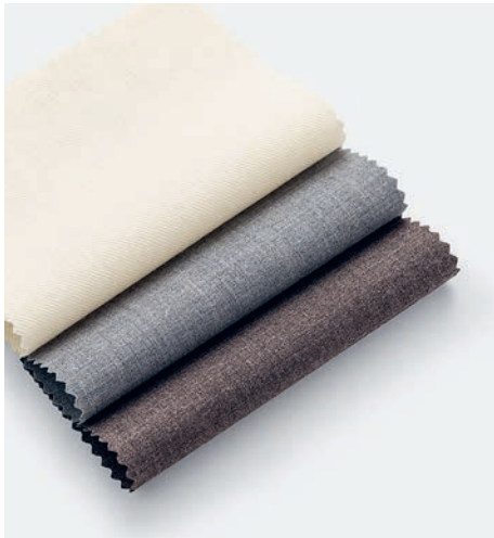
6054, 6063 & 6061 (Jersely)

Jersely combines performance, comfort and an impeccable look in a fabric designed to adapt to the movements of the body. It unites the supple knitted effect of jersey with the refined properties of classic woven cloth. Crafted from wool with a hint of