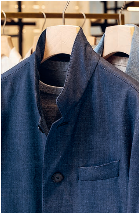
Informal jacket with Nehru collar ASF012

Spring/Summer 2026 marks a season of ease in motion – an evolution of menswear shaped by breathable fabrics, natural stretch and the quiet confidence of lighter, looser silhouettes. This collection traces a deliberate arc: breaking away from tradition just long enough to rediscover why it mattered in the first place. Refined patterns, airy textures and a fresh spectrum of colours bring renewed clarity to warm-weather dressing, while craftsmanship remains firmly rooted in the world's most esteemed mills.