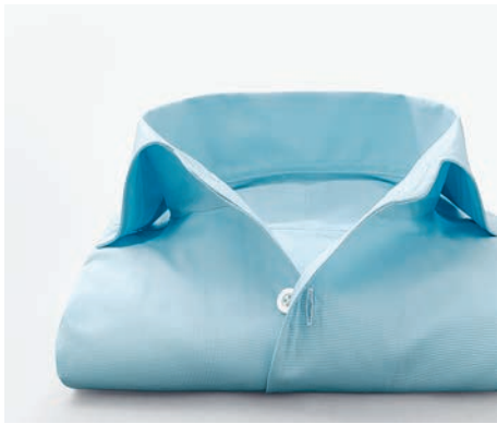
SH00458 (Light cotton)

Light cotton Light and delicate, this superfine zephyr cotton poplin has a smooth, balanced structure and a clean look. Offered in a bold colour range, it captures the distinctive character of Thomas Mason. Available in six micro-houndstoots, seven micro-checks and twelve gingham checks.