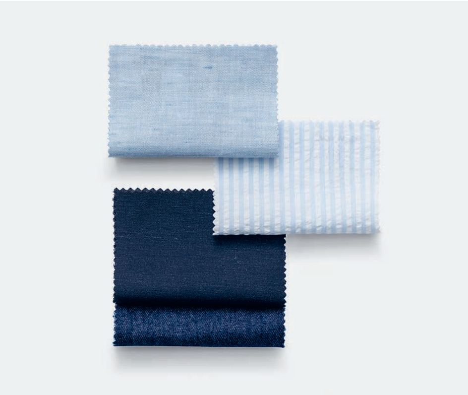
SH00441, SH00444, SH00442, SH00445

Yoga natural stretch cottons by Albini Crafted with an innovative finish that enhances the fabric’s natural elasticity, these cottons offer exceptional comfort and freedom of movement. This season, the collection expands with two refined weaves: dobby and microstructure, each adding a distinctive texture and depth to the fabric’s elegant, modern appeal. Perfect for effortlessly flexible looks that move with you. Part of our 365 collection, they are designed for year-round wear.