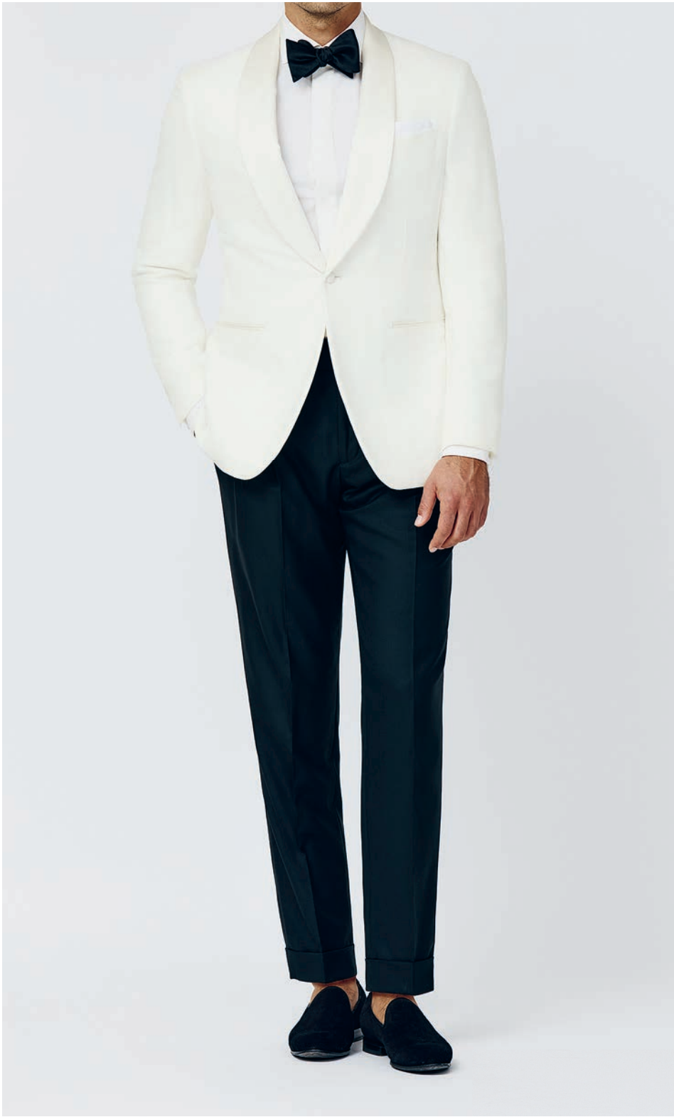
Look EVE012 Off-white bamboo dinner jacket - SH00103 Ivory compact cotton poplin tuxedo shirt - REV013 Black S150 wool trousers - TSAT003 Black satin bow tie - SDE01 Black suede plain toe loafers (Made in Italy)