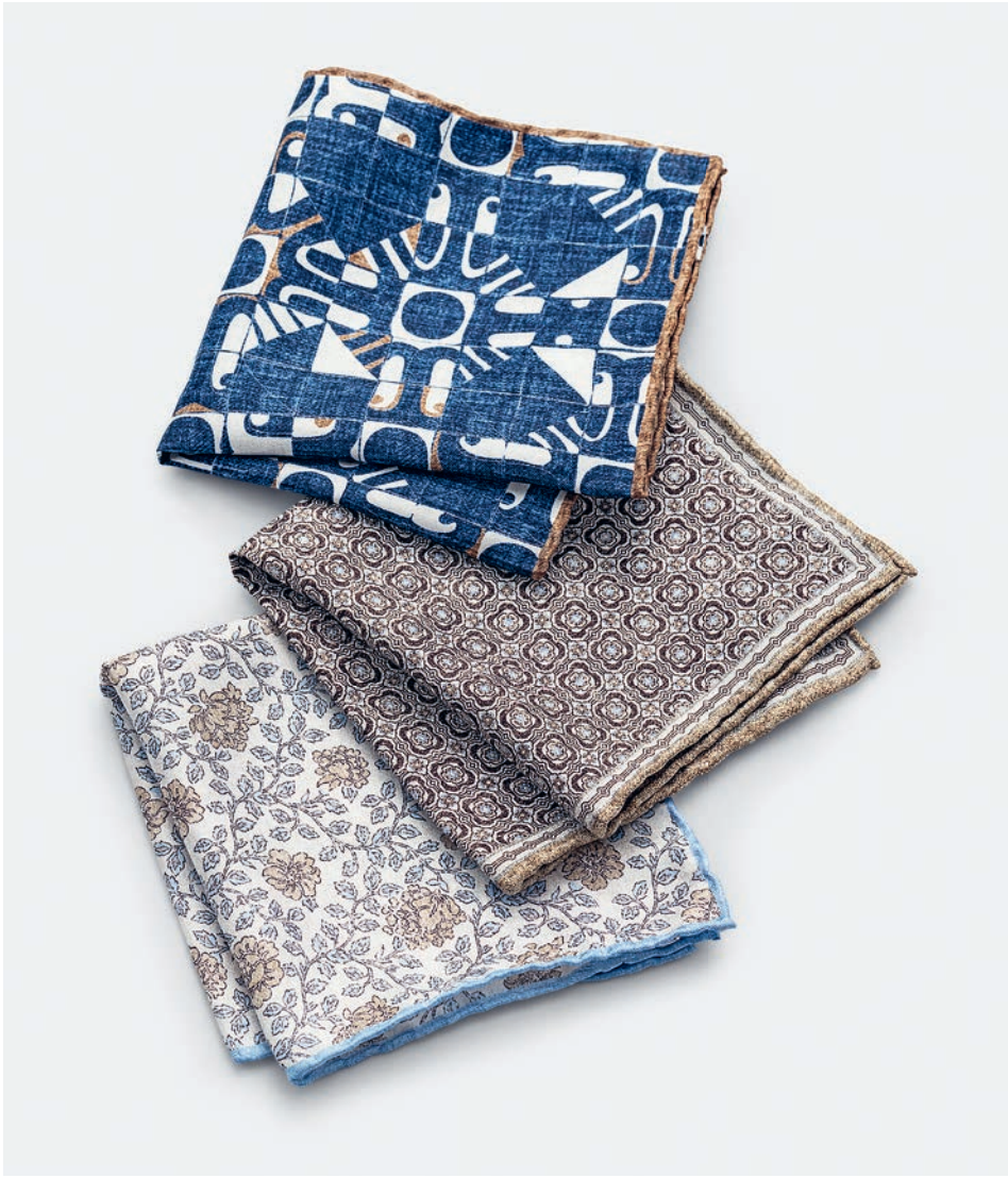
PS624, PS623 & PS622