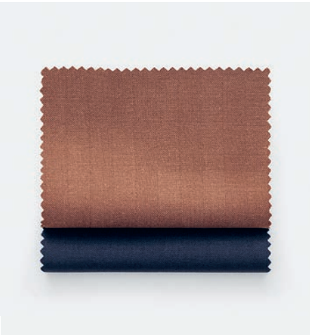
6071 & 6088 (Solaro)

Solaro , a refined wool S130 bi-stretch fabric woven in a subtle herringbone, offers lightweight comfort and flexibility for all seasons. With its elegant two-tone effect, it transitions seamlessly from office ready to off-duty refinement, as well as festive events or weddings. A true staple for the modern wardrobe.