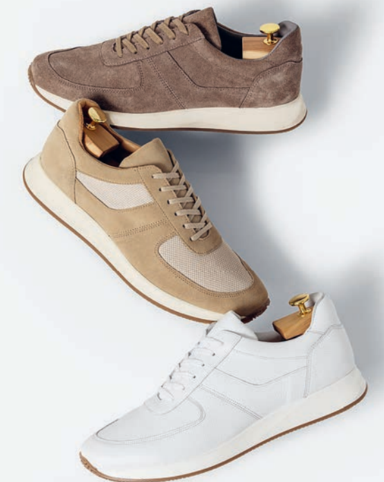
SDE14, SDE12 & SNG07

Choose from a range of materials and colour combinations. Mix and match leather with leather or leather with mesh.