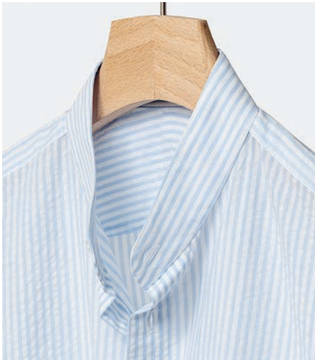
SH00444 (Cotton Seersucker)

Yoga natural stretch cotton Oxfords by Albini This season, the classic Oxford weave returns with a fresh update of 365 fabrics. Crafted with the same innovative stretch finish for natural flexibility, the collection now features new striped colours that add a contemporary touch to this timeless favourite. Perfect for relaxed yet polished looks that combine comfort and sophistication.