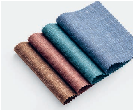
9197, 9193, 9189 & 9185 (Wool, Silk & Linen)

Jersely Basketweave introduces a unique expression within the Jersely line made in Italy by Loro Piana. Woven from a blend of wool, cotton, silk and linen, it brings together softness, resilience and breathability with the added character of a basketweave structure. The result is a fabric that feels relaxed yet sophisticated, offering subtle texture for an effortlessly elevated wardrobe.