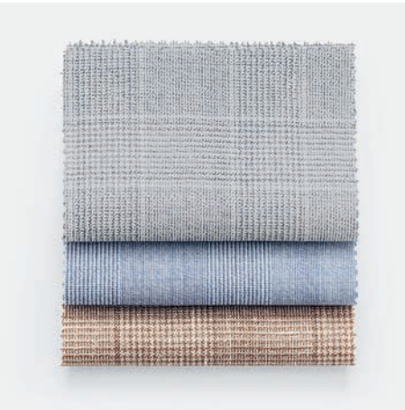
6064, 6078 & 6067 (Glencheck)

Glencheck brings a timeless pattern to modern tailoring in lightweight, breathable fabrics. Whether pure wool or a refined blend of wool, silk and linen, each cloth offers natural comfort with an elegant drape. Versatile and contemporary, these fabrics are ideal for both work and everyday wear, adding subtle character to any wardrobe.