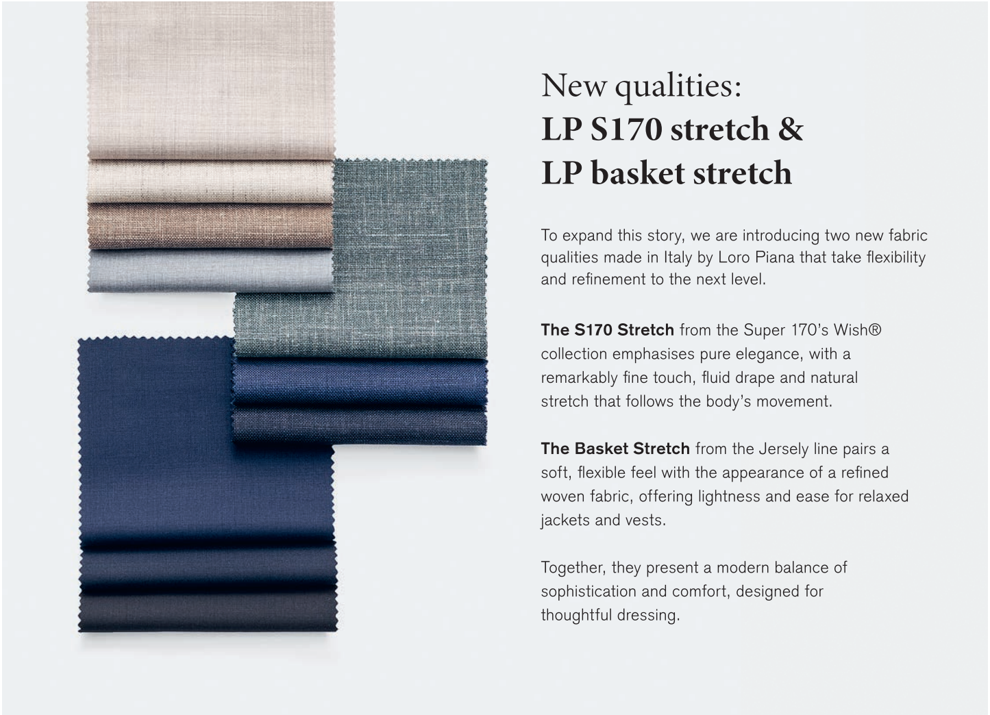
ASF039, SH00376 & LIN002

Built on the principles of comfort, versatility and effortless sophistication, the collection brings together timeless classics that can be worn year-round.