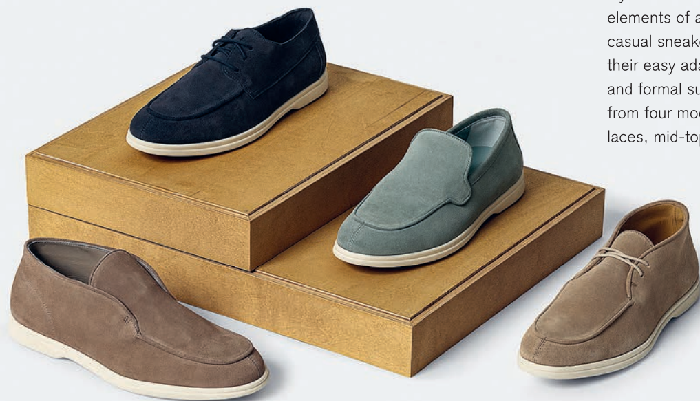
SDE13, SDE25, SDE24 & SDE12

Hybrid models that seamlessly blend elements of a loafer, dress shoe and casual sneaker. These styles stand out for their easy adaptability to both laid-back and formal summer looks. You can choose from four models: low-top, low-top with laces, mid-top and mid-top with laces.