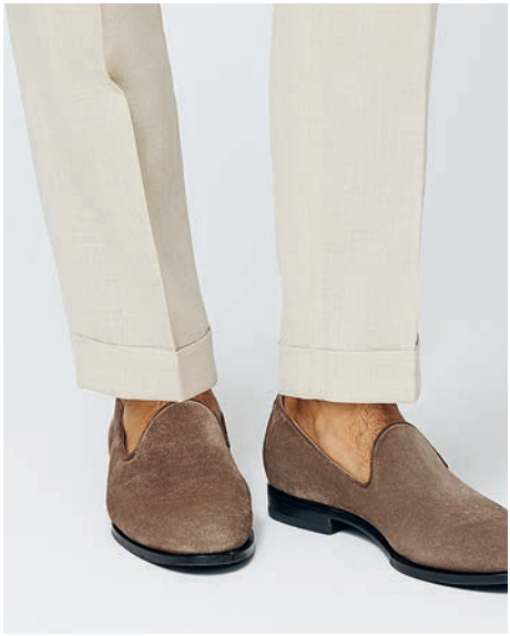
Look 6055 (LP - SU) Ecru mélange tropical wool-silk-linen 3-piece suit - SH00144 White cotton dobby shirt - TGREN012 Off white grenadine tie - PSILK028 White silk pocket square - SDE14 L.taupe suede plain toe loafers ( Made in Portugal )