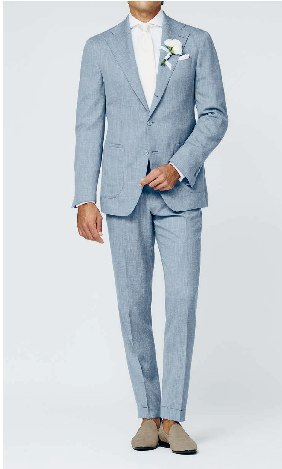
Look 6076 (LP - SU) Neapolitan blue mélange tropical wool-silk-linen suit - SH00144 White cotton dobby shirt - TGREN012 Off white grenadine tie - EVE015 Ivory wool blend dotted pocket square - SUS06 Summer suede sand plain toe loafers (Made in Italy)