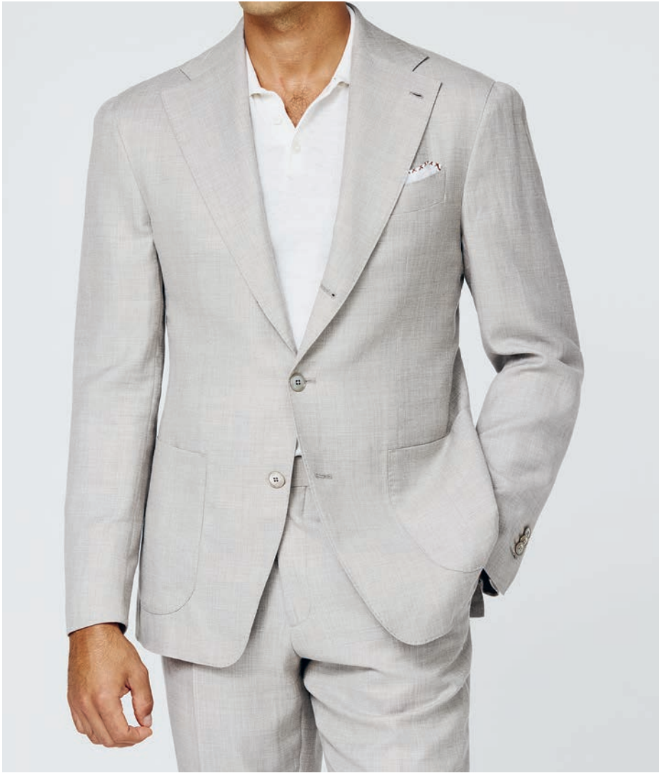
Look 6058 (LP - LW) Bone mélange linen-wool-silk sharkskin suit - K10151 White cotton-silk polo knit - PLIN007 White linen m. brown handsitched pocket square - SDE15 Taupe suede plain toe loafers (Made in Portugal)