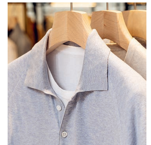
K10238 & K10231

Available in fifteen 365 and eight 365 seasonal colours – offered in single yarn and double yarn.