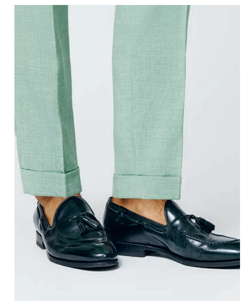
Look 6079 Mint green stretch tropical wool-linen blend 3-piece suit - SH00144 White cotton dobby shirt - TGREN022 Light turquoise-white grenadine tie - POA06 Green polished antique tassel loafers (Made in Italy)