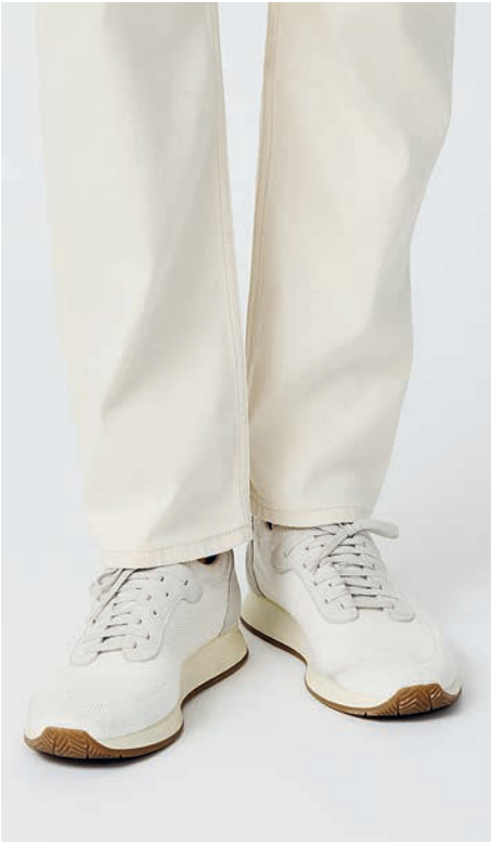
Look 9177 Off-white-ecru linen-silk-wool-cotton herringbone jacket - SH00162 White cotton-linen shirt - TLN003 D.taupe stretch wool-linen blend plain weave tie - PLIN001 White linen pocket square - WAS025 Ecru stretch jeans - KNI01 Off-white knit runners (Made in Portugal)