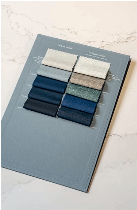
All-Season Flex inlay