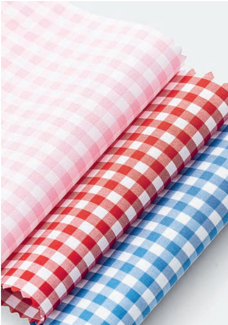
SH00473, SH00479 & SH00476 (Light cotton)

Fine cotton bengal stripes A classic of the Thomas Mason world, this poplin pairs brilliant whiteness with exceptional handle, vibrancy and durability. Available in six bengal stripes, it offers a crisp, enduring expression of iconic heritage.