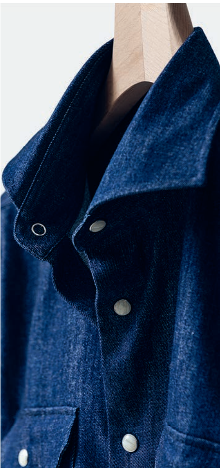
SH00445 (Washed cotton denim)