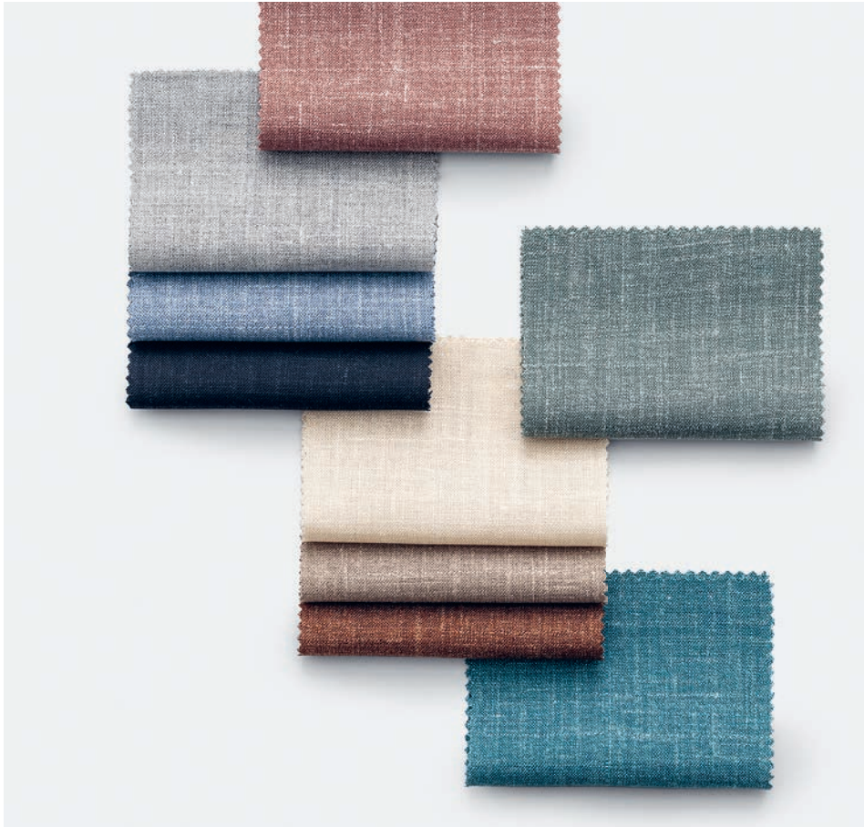
6055, 6060, 6070, 6073, 6081, 6080, 6062, 6076 & 6087 (Summertime)