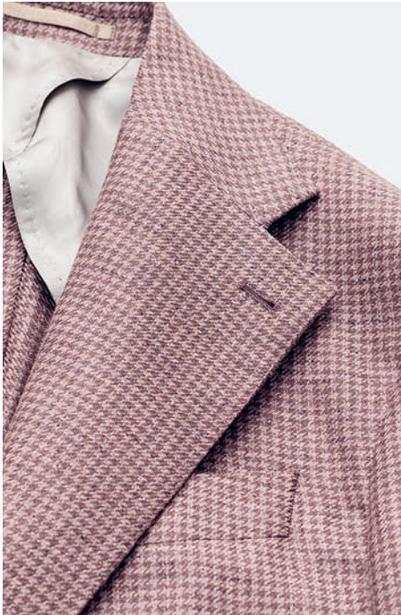
9190 (Silk Houndstooth)

Highlights include a beautiful herringbone from Ferla and Softime fabrics from Loro Piana, alongside a refined linen, wool, silk stretch quality by Ermenegildo Zegna that elevates the selection even further. The palette mirrors the season's trends: mauve pink, petrol, sage green, light blues, and sand – modern shades that refresh the classics without overpowering them. With 24 seasonal fabrics to choose from, this collection offers the perfect canvas for a jacket that feels both contemporary and timeless.