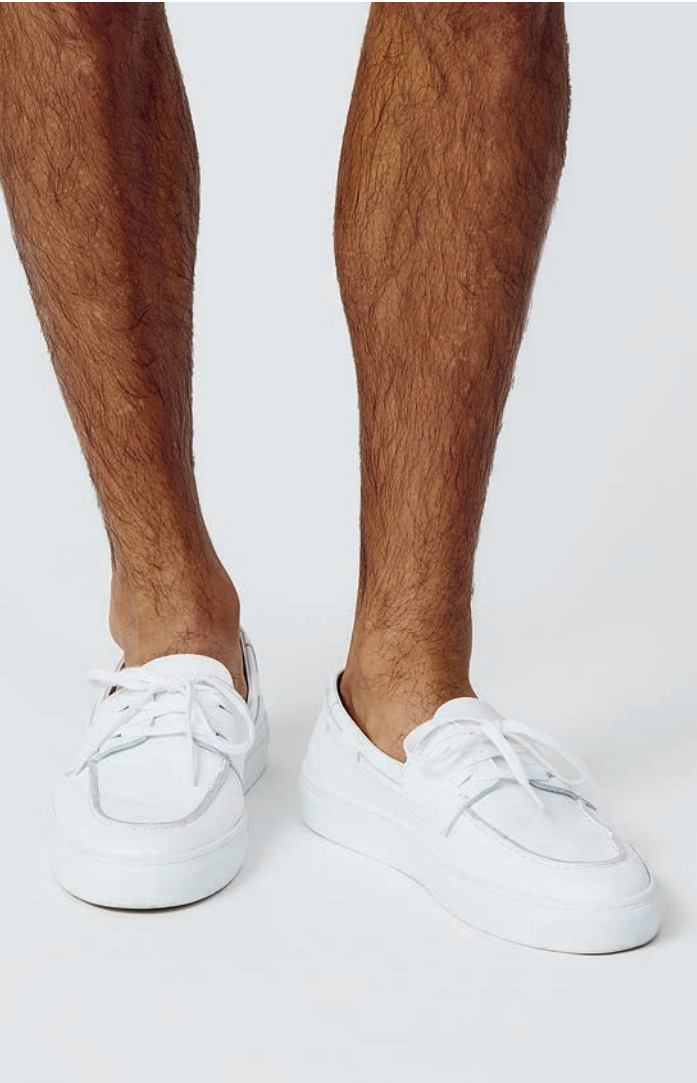
SNG07 boat shoe

To make them your own, nine sole colours are available for personalised styling.