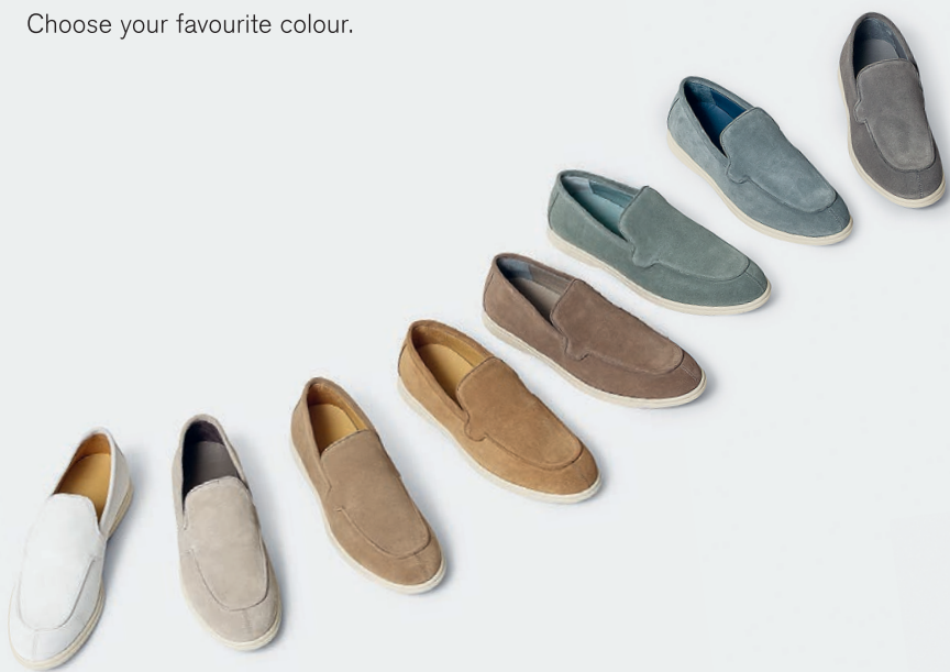
SDE11, SDE13, SDE13, SDE17, SDE14, SDE22, SDE24 & SDE29