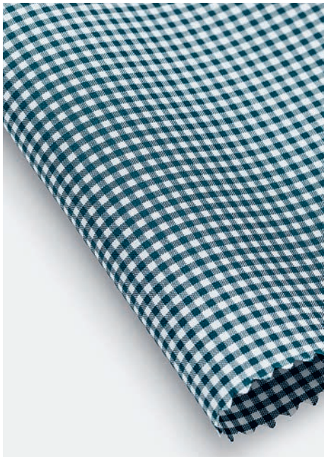
SH00468 (Light cotton)