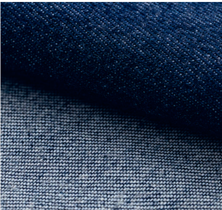
SH00445 (Washed cotton denim)

Washed cotton denim A new addition to the 365 collection, this slubbed denim twill captures the character of a well-worn vintage aesthetic. Made from refined cotton with added stretch for comfortable movement and a soft handfeel. With a weight of 350gr, the fabric has the perfect structure for creating an overshirt. The result is a versatile, smart-casual quality that delivers effortless comfort and timeless appeal, ideal for year-round wear.