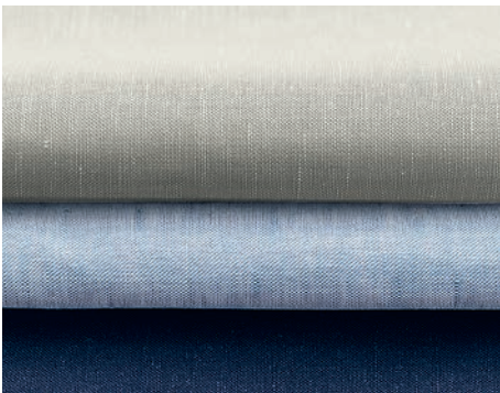
SH00442, SH00441 & SH00443 (Cotton-Linen Chambray)

Cotton-linen chambray A refined blend of cotton and linen highlights the natural beauty and texture of this fabric. Light, breathable and comfortably structured, it offers natural flexibility without added stretch. With its crisp yet soft handfeel and fluid drape, it’s perfect for both relaxed and refined looks. Easy to care for, more sustainable and biodegradable, it’s a timeless four-season essential for modern shirting. This season, the collection expands with two new 365 fabrics and one 365 Seasonal.