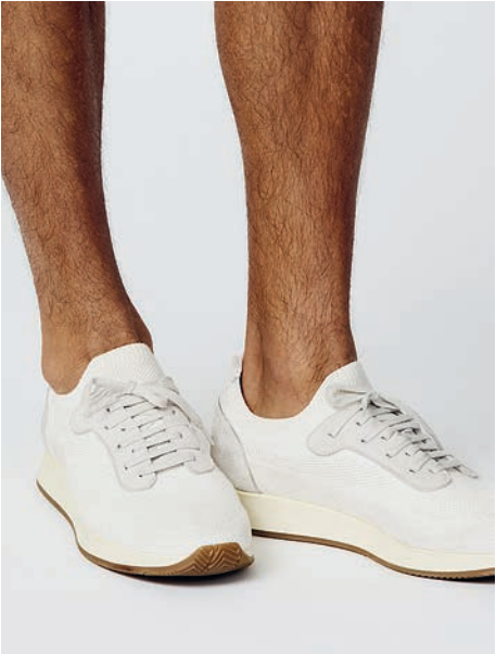
Look K10239 Ecru cotton polo knit - K10239 Ecru cotton leisure shorts - KNI01 Off-white runners (Made in Portugal)