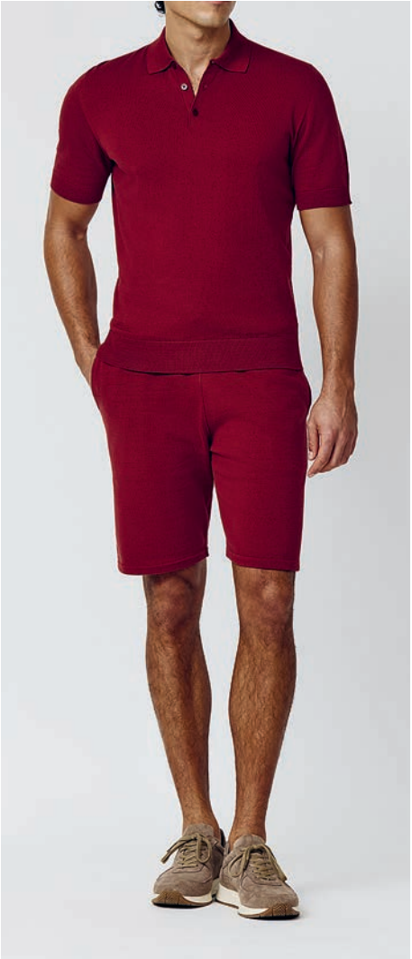
Look KS10250 Rusty red cotton polo knit - KS10250 Rusty red cotton leisure shorts - SDE14 L. taupe suede runners (Made in Portugal)